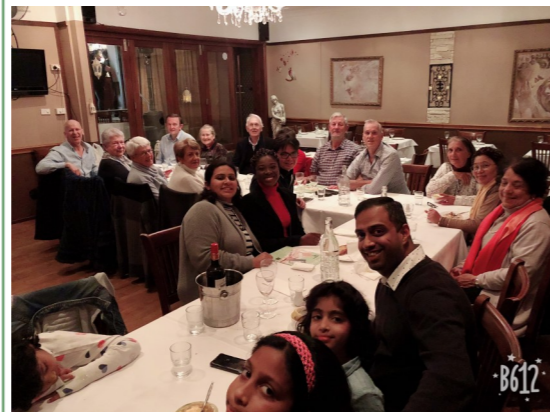
Secondary School Catechist Dinner held at Borrellis' Italian Restaurant on Saturday, 4th August.